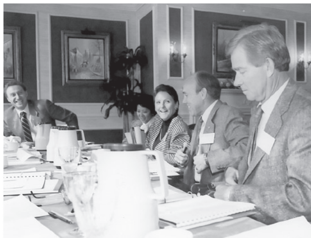
A meeting of the Endowment and Memorial Fund, the precursor to the current AAE Foundation, in the mid-1980s.

As the philanthropic dollars grow, sharing resources becomes even more critical to implementing effective programs. The average funding for a research grant has been about $11,000. The smallest grants have been about $1,000 and the largest around $35,000. This year for the first time, the Foundation will consider providing up to $4 million over eight years for a clinical research study. Proposals were solicited via a request for proposal process. The AAE Research and Scientific Affairs Committee and Evidence-Based Endodontics