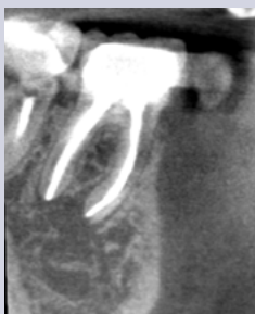
Fig. 2b. Sagittal CBCT slice of tooth #30. Note extensive periapical radiolucency.

CBCT, however, can reveal bone defects of the cancellous bone and cortical bone separately. The prevalence of apical periodontitis was found to be significantly higher when using CBCT, in comparison with periapical radiographs. 20 Moreover, the information obtained by CBCT evaluation of periapical repair following root canal treatment was comparable to histological analysis, whereas conventional radiographs underestimated the size of the periapical lesion. 24 One study showed that 34% of the radiolucencies detected with CBCT were missed with periapical radiography in maxillary premolars and molars. 22 It was concluded that the detection of apical periodontitis was considerably higher with CBCT than with periapical radiography. 20 Thus, CBCT was found to be a more sensitive diagnostic method to identify apical periodontitis.