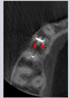
Fig.1. Axial CBCT image of teeth #3-6. Beam hardening artifacts (dark lines) can be seen going mesiodistally from the root filling materials on teeth #4 and 5. These are NOT root fractures.

Interpretation: Clinicians ordering a CBCT are responsible for interpreting the entire image volume just as they are for any other radiographic image. Any radiograph may demonstrate findings that are significant to the health of the patient. There is no informed consent process that allows the clinician to interpret only a specific area of an image volume. Therefore, the clinician can be liable for a missed diagnosis, even if it is outside of his or her area of practice. Any questions by the practitioner regarding image data interpretation should promptly be referred to a specialist in oral and maxillofacial radiology. 17,18