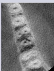
Fig. 4b. Axial CBCT slice of same tooth revealing a strip perforation of distal root at a level coronal to separated instrument.