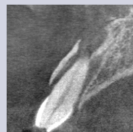
Fig. 6b. CBCT sagittal view of tooth #9 revealing lateral luxation and alveolar fracture.