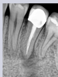
Fig. 5a. Periapical radiograph of tooth #20. There is an associated radiolucency at the apex of this root-filled tooth.