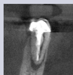
Fig. 5b. Coronal CBCT slice of the same tooth revealing a missed buccal canal and an associated apical radiolucency.