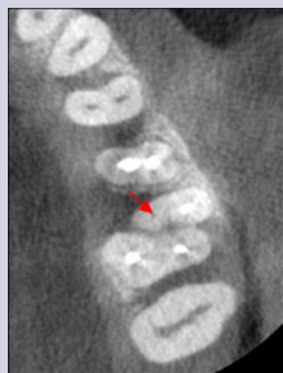
Fig. 3. Axial CBCT slice of maxillary left quadrant. Note missed MB2 canal of tooth #14.

Assessment of Tooth Morphology and Complications: Root morphology and bony topography can be visualized in 3-D, as can the number of root canals and whether they converge or diverge from each other. Unidentified and untreated root canals may be identified using axial slices, which may not be readily identifiable with periapical radiographs. 2,26 The efficacy of CBCT as a modality to accurately identify the presence of second mesiobuccal canals in maxillary first and second molars has been evaluated. 28 The CBCT images accurately identified the presence or absence of the MB2 canal in 78.95% of samples. Statistical analysis showed that there was no significant difference in the ability of CBCT scanning to detect the MB2 canal when compared with the gold standard of clinical sectioning. Additionally, CBCT images have clearly demonstrated the presence of untreated or missed canals intraoperatively or in root-filled teeth, as well as complications ( i.e. , perforations) (Figures 3-5). As such, it appears that the use of CBCT for nonsurgical as well as surgical retreatment can be quite advantageous to the clinician.