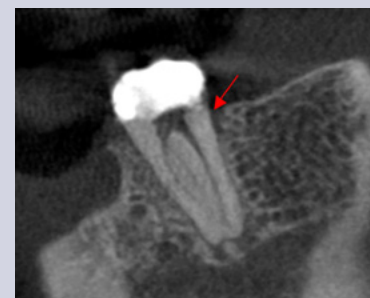
Fig. 7. Sagittal CBCT slice of tooth #18 revealing an isolated osseous radiolucent defect along the mid-distal aspect suggestive of a root fracture.

Conventional intraoral radiography provides clinicians with cost-effective, high-resolution imaging that continues to be the front-line method for dental imaging. However, it is clear that there are many specific situations where the 3-D images produced by CBCT facilitates diagnosis and influences treatment. The usefulness of the CBCT cannot be disputed. It is a valuable task-specific imaging modality, producing minimal radiation exposure to the patient and providing maximal information to the clinician.