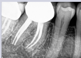
Fig. 2a. Periapical radiograph of tooth #30.

Detection of Apical Periodontitis: CBCT enables the detection of radiolucent findings before they are visualized on conventional radiographs (Figures 2a and 2b). 19-24 Lesions in the cortical bone can only be detected radiographically when there is perforation of the bone cortex, erosion from the inner surface of the bone cortex, or extensive erosion or defects on the outer surface. It is known that periapical lesions in cancellous bone cannot be detected radiographically. 25