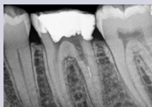
Fig. 4a. Periapical radiograph of tooth #19 with separated instrument in distal root.