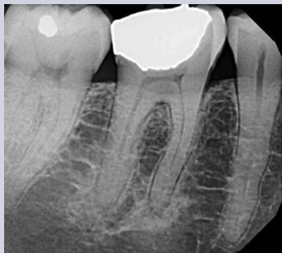
Fig. 1. Mandibular right first molar had been hypersensitive to cold and sweets over the past few months but the symptoms have subsided. Now there is no response to thermal testing and there is tenderness to biting and pain to percussion. Radiographically, there are diffuse radiopacities around the root apices. Diagnosis: Pulp necrosis; symptomatic apical periodontitis with condensing osteitis. Non-surgical endodontic treatment is indicated followed by a build-up and crown. Over time the condensing osteitis should regress partially or totally (15).