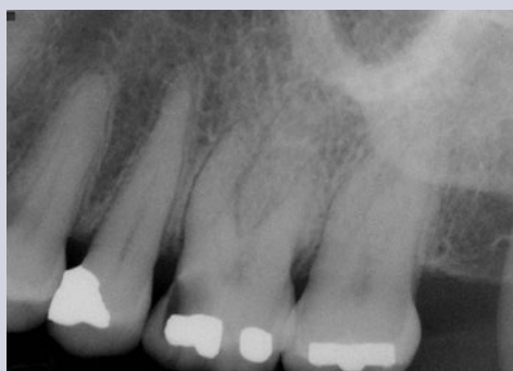
Fig. 3. Maxillary left first molar has occlusal-mesial caries and the patient has been complaining of sensitivity to sweets and to cold liquids. There is no discomfort to biting or percussion. The tooth is hyper-responsive to Endo-Ice® with no lingering pain. Diagnosis: reversible pulpitis; normal apical tissues. Treatment would be excavation of the caries followed by placement of a permanent restoration. If the pulp is exposed, treatment would be non-surgical endodontic treatment followed by a permanent restoration such as a crown.