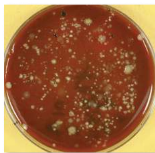
Figure 4: Cultivation of polymicrobial endodontic infection.

However, effective treatment of endodontic infections also includes removal of the reservoir of infection by either endodontic treatment or tooth extraction. Successful management of the infected root canal system requires chemomechanical debridement of the root canal system. Three to 12 species of bacteria can usually be cultured from infected root canals