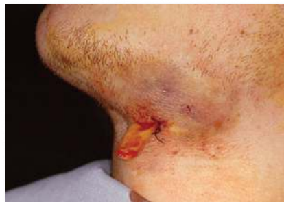
Figure 5: Extraoral drain sutured into incision for drainage.

One of the more common side effects of antibiotic therapy is diarrhea, which results from the antibiotic disrupting the normal balance of intestinal flora. Antibiotic-associated colitis/pseudomembranous colitis has been associated with the use of many antibiotics, but only rarely associated with dental therapy (7). Patients requiring extraoral drainage or hospitalization should be referred to an oral surgeon (Figure 5).