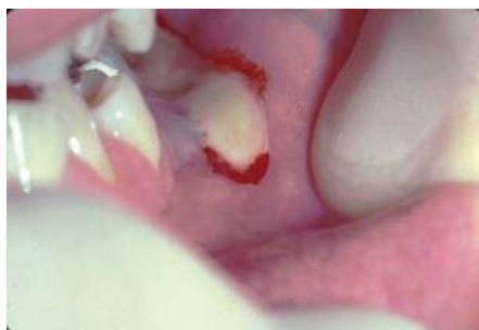
Figure 2: Intraoral drainage of purulent exudate.

Soft tissue swelling of endodontic origin should be incised for drainage (Figure 2).