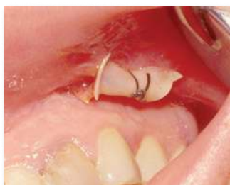
Figure 3: Intraoral drain sutured into incision for drainage.

In most cases, a drain placed in the incision for 24-48 hours will allow for adequate drainage (Figure 3).