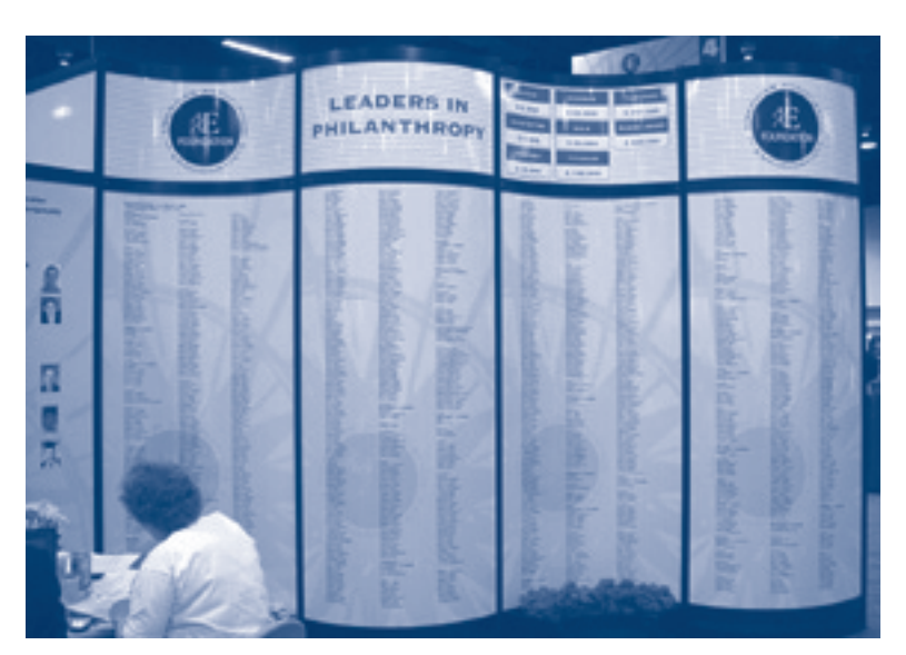
Stop by the Donor Honor Roll at the AAE Oasis to see your name and learn who else you can congratulate for supporting the Foundation.

New this year, will be a two-day silent auction in the exhibit hall. Members will have a chance to peruse and bid on the latest products while visiting with various exhibitors. Register for the Silent Auction by filling out the form included in meeting registration materials. For information about the items and exhibitors participating in this year's product auctions, visit the AAE Foundation Web site.