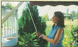
Just unroll your SunSetter — it's quiet and easy!