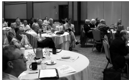
The last Educator Workshop was held in 2007 for program directors. An event was not held in 2008 as many educators participated in the Consensus Conference on Diagnostic Terminology.

Given the nature of this year's topic, corporate representatives from select dental companies will join the 67 predoctoral directors for a half-day program on August 14. These two groups along with members of the AAE Corporate Relations Committee, Endodontic Educator Fellowship Award recipients and the AAE Executive Committee, will participate in didactic presentations and break-out group discussions on