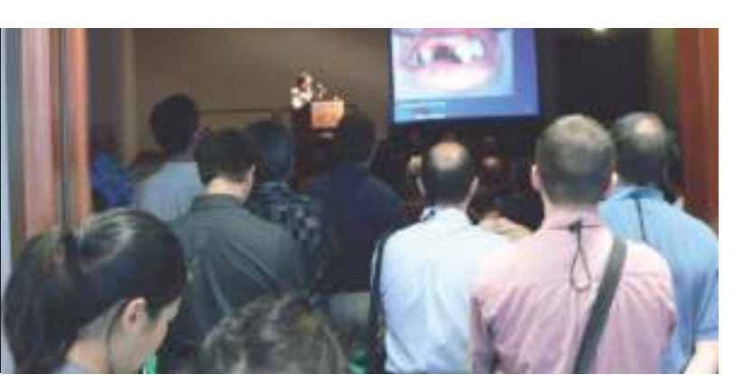
Attendees of a popular educational session at the 2006 Annual Session spill out into the hall of the Hawaii Convention Center.