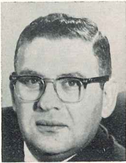
Seymour Altshuler Program

Just as Philadelphia once attracted the political leaders of the thirteen colonies, so today we are proud to have attracted the dental leaders of many states and foreign countries. We hope the exchange of ideas will prove so stimulating and profitable that you will return to visit us before and beyond 1976.