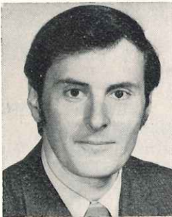
Calvin Torneck Program