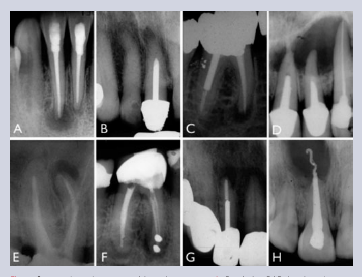
Fig. 5. Some selected cases requiring microsurgery: A. Persisting PAR despite adequate endodontic treatment, B. Calcification, C. Apical transportation of the mesial root, D. Large post without endodontics and a large PAR in anterior teeth, E. Broken file at apical one-third and PAR, F. Failed traditional technique apical surgery, G. Excellent endodontic treatment with post but persistent PAR in maxillary anterior, H. Overfilled root canal with large persisting PAR.

In approximately 20 percent of cases that involve periapical lesions, nonsurgical endodontic treatment may simply not work due to the cystic nature of the lesions.<sup>27, 28,29</sup> Such lesions must be treated by surgical intervention, although some advocate that cystic lesions could heal by nonsurgical treatment.<sup>30</sup> Evidence suggests that there is an approximate reduction of 20 percent success when a PAR is present compared with cases without a PAR. This difference may possibly be due to the cystic nature of the lesion.