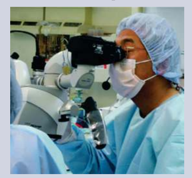
Fig. 1. An endodontist performing microsurgery using an operating microscope.

Endodontic microsurgery (apicoectomy) in its broadest sense is the treatment performed on the root apices of an infected tooth, followed by placement of a filling (retrofilling) to seal the root end. In the past, this surgical procedure was performed by endodontists, oral surgeons and general practitioners using the then-traditional techniques of preparing the canal space with a round bur attached to a straight handpiece and using amalgam as the root-end filling material. Advances over the past decades, supported by ongoing research, have led to a refinement of these techniques, materials and instruments. These advancements are centered on the use of the surgical operating microscope to provide unsurpassed magnification and illumination for all phases of the treatment process.