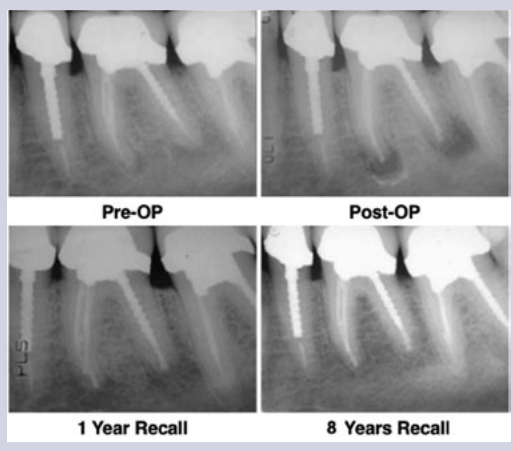
Fig. 6. An 8-year recall of #19 treated by microsurgery. Notice the complete resolution of the PAR and total regeneration of the periapical tissues.

The decision to retreat a case surgically or nonsurgically can be a challenge and should be based on individual circumstances. Current research has shown that when the initial root canal treatment appears to be performed in an adequate fashion, the success of a nonsurgical retreatment is significantly decreased, suggesting that apical surgery may be the preferred option. As shown in the previous section on indications for endodontic microsurgery, clinicians must advise patients that the microsurgical approach is a treatment option that is preferred to nonsurgical retreatment, extraction or implant placement. Implants are a marvel of modern-day dentistry where indicated, but abuse of this technique can be catastrophic for patients.